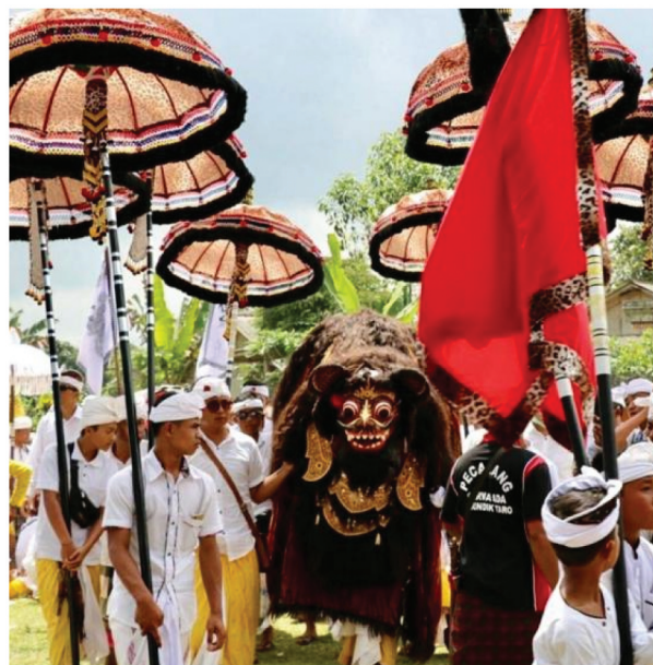
Figure 2. Kriya be Bali Barong Ket is sacred to the people (Bali Tribune, 2018).