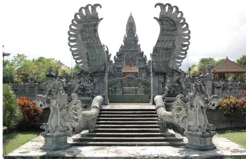
Figure 8. Kriya bebali Candi Laras Kampid Cangak at Jagatnatha Temple, Jembrana, Bali. (Sunarya, 2011, p. 235).