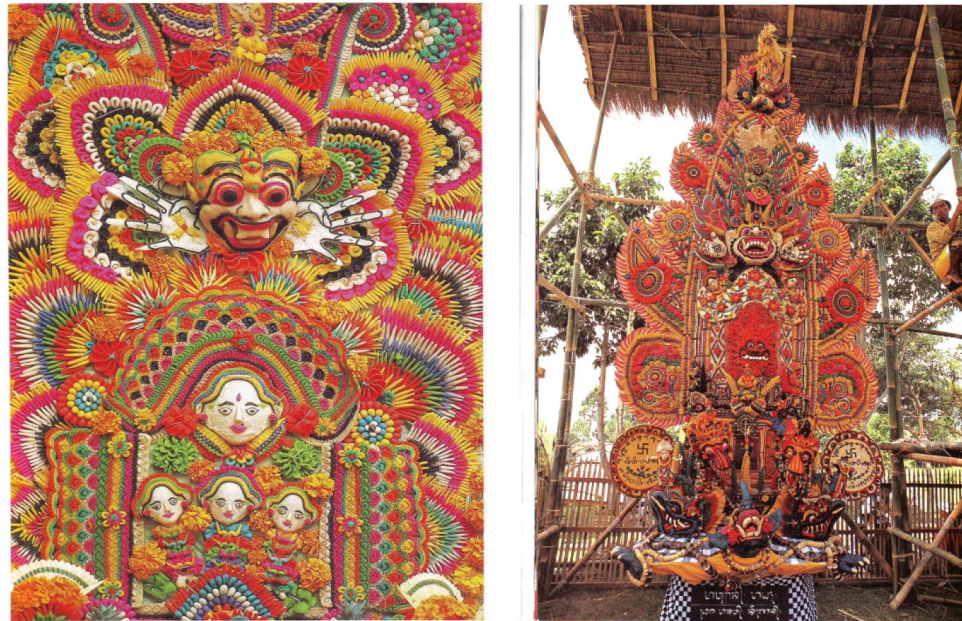
Figure 6. Kriya bebali sarad Mount Mandara Giri (Author's document, 1990).