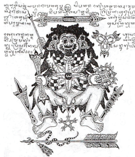
Figure 3. Kriya bebal raja Rangda (Hooykaas, 1980, p. 319) and Kriya bebal Dewi Durga (Author's document, 1990).

The whole life of the Balinese Hindu community with the kriya bebal as ceremonial equipment reinforces the community's belief in the religion they profess. In life, the main goal of the Balinese Hindu community is to achieve happiness through a harmonious life. And the functioning of kriya bebal Semara-Ratih shows such a condition. This kriya bebal of eternal happiness is depicted in the form of a combination of Dewa Asmara and Dewi Ratih. The Balinese Hindu community believes that rubbing the face of the bride and groom with raja Semara-Ratih during the wedding