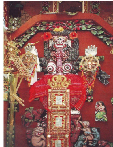
Figure 4. Kriya bebal Raja Semara-Ratih (Balitaksuu_rerajahan, 2019) and Kriya bebal Raja Semara-Ratih in wedding (Author's document, 1990).