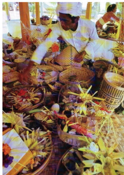
Figure 1. Kriya bebal offerings in the form of bakti to purify desa (place), kala (time), and patra (circumstances) (Gede, 1979, p. 31) and offerings that are sold in the market (Kangin, 2012).

The movement of Bali towards jagadhita is not only based on the ability of creative human resources but also the potential of natural and cultural resources. If properly managed, these various sources of wealth will become the assets towards jagadhita . Therefore, the author agrees with Doffana's statement (Doffana, 2019, p. 13), which states that sacred natural sites are very